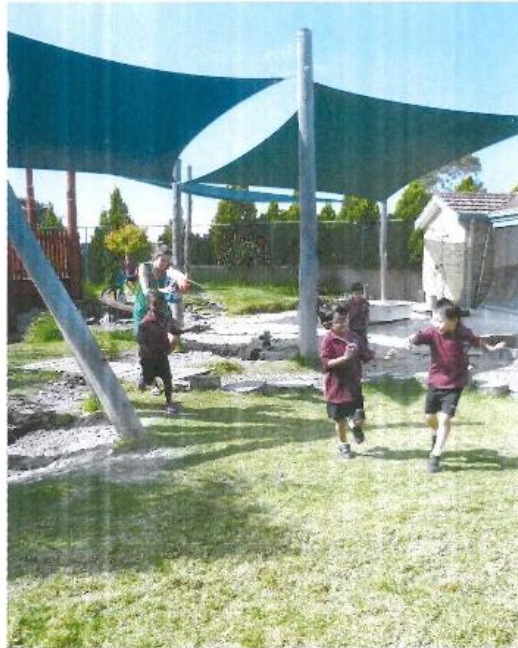
Easter egg hunt was SO fun!!!

What a fun last day the Pre-Primary class had! To celebrate the Easter holidays we school term off having a class previously to the Easter him to join us at tried to entice promise of pizza, and ice creams! enjoying some our party the snuck into our left us a special letter said that Easter Bunny) eggs in the garden We were so