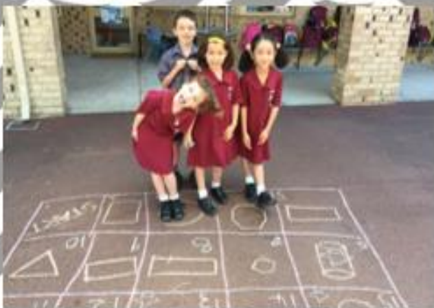
Shapes and Ladders