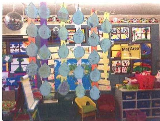
Water - life giving

Over the past two weeks the children have explored the life of an earthworm and discovered how this wonderful creature helps the Earth to breathe.